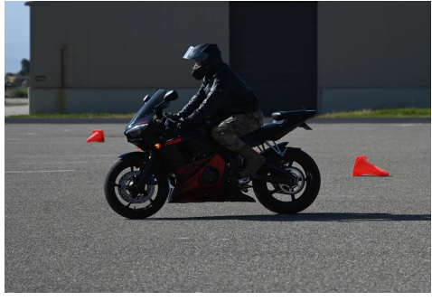
A base member participates in a motorcycle safety training course held on base at Vandenberg Space Force Base, California, April 14, 2023.